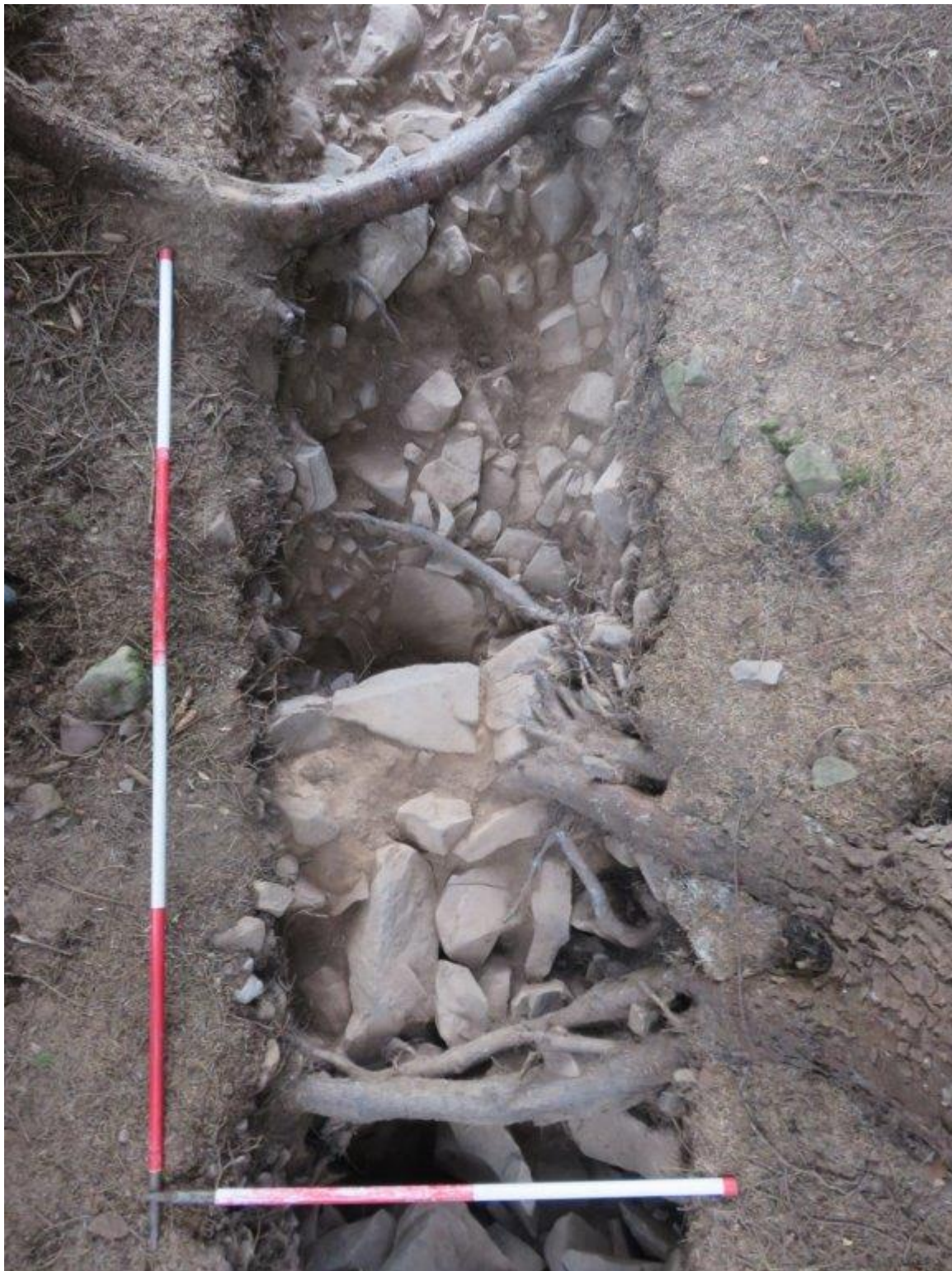
Figure 2 Wall C3 showing the interior face angled due to the intrusion of tree roots.

Most of the finds came from the topsoil and included finds of the 17th to 19th centuries; pottery, bottle glass and clay pipe. The grey silty layer produced 10 shards of bottle glass, 4 sherds of medieval/post-medieval pottery and a piece of haematite, suggesting a late 17 th or early 18 th century date for the destruction and levelling of the building.