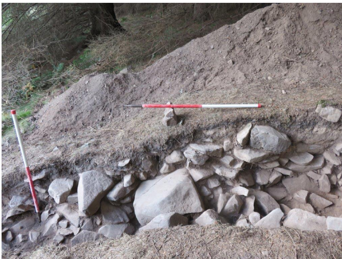
Figure 3 Wall C4 is visible immediately right of the large boulder in the N baulk section overlain by grey-silty demolition layer C2 to its right.