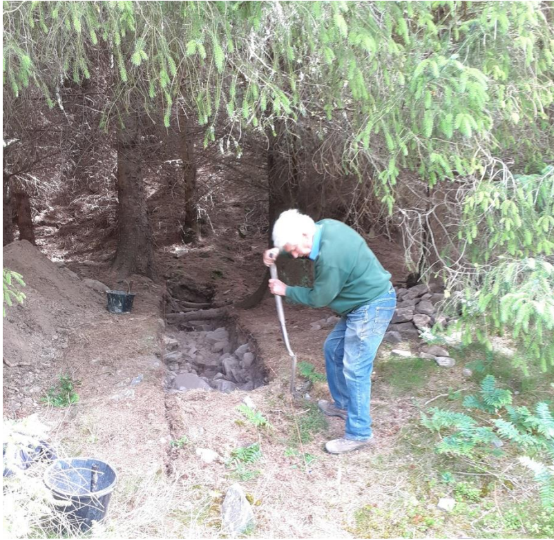
Frontispiece: view of the trench from the showing the trench across the platform being extended