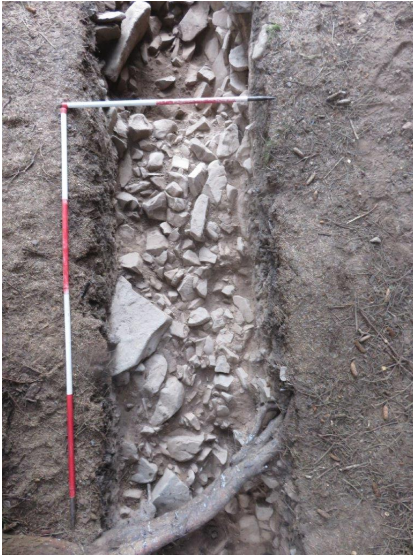
Figure 4 Bedrock brush of angular stones forms the base of the interior of the building and one large flat stone, possibly a paving stone. Note the cut for the base of the W wall at right angle to trench.